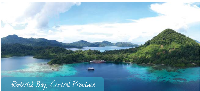
Roderick Bay, Central Province

With nearly 1000 islands, some dive sites are not a simple step away from your hotel. The Solomons Islands has two award winning liveboard operators, Bilikiki Cruises and Solomons Master that offer the ability to navigate between the maze of islands and get you to the furthest-afield sites, the trip itself also making for a memorable experience.