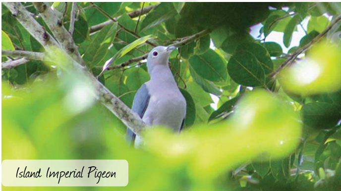
Island Imperial Pigeon

Some of the treks into the interior mountains can prove trails and requires a good level of fitness and the right equipment. Wishing to get a glimpse of as many endemic species as possible means you may need to venture well off the beaten track, and be prepared to travel in boats and small aircraft.